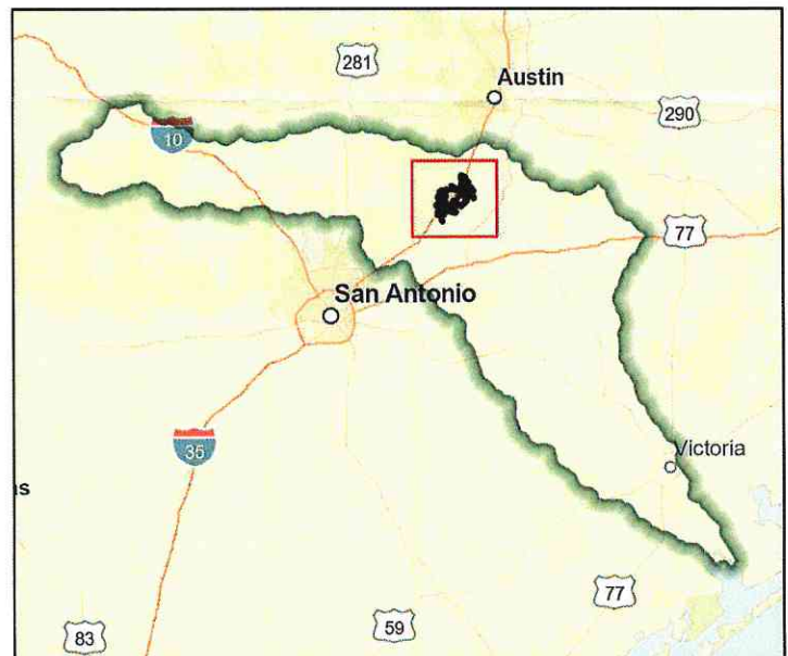
Regional view of FME Area